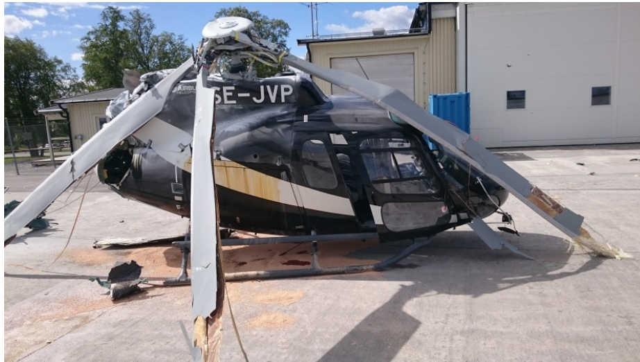
Figure 1. The helicopter after the accident.