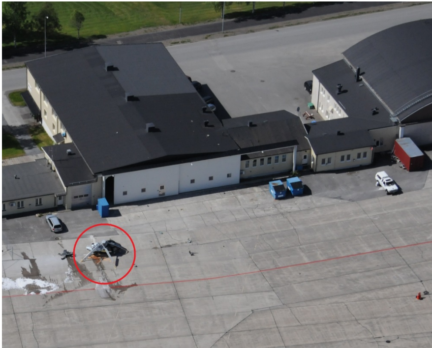
Figure 3. The accident site market with a red ring and located approximately 50 meters from the intended parking site.