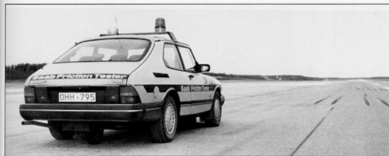
SAAB Friction Tester

All approved equipment simulates the friction values generated by an aircraft on takeoff and landing, and consist of a mechanical part and an electronic part. On the Skiddometer BV11 the mechanical part is housed in a trailer towed by a car containing the electronic equipment. Both the Surface and Safegate Friction Testers have the electronic and the mechanical parts together built into a Saab car.