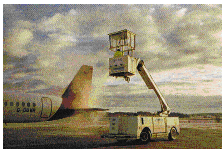
Figure 1. Type DIV 110 de-icing vehicle.

The de-icing staff are also responsible for checking that all snow, ice and frost are removed from the aircraft. After completing the de-icing and checking, the method, type of de-icing fluid and mixture proportions are reported to and approved by the commander. This communication normally takes place by the handover of a written message to the commander, through the cockpit window. The message may also be delivered by radio communication between the aircraft and de-icing vehicle operator or via the person assisting on the ground.